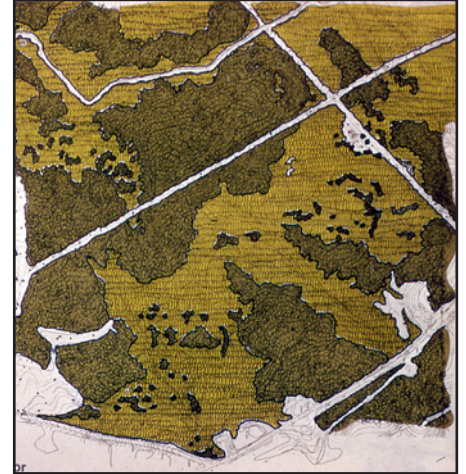
CAMERON'S CROSSING, ATLANTA