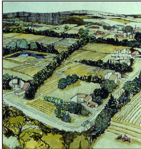
HALTON RURAL STUDY