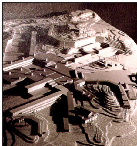
ESPOO NEW TOWN, ENGLAND