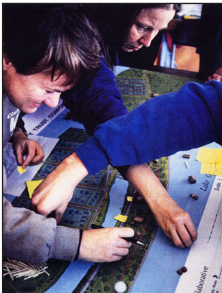
TORONTO ISLAND COMMUNITY PARTICIPATION