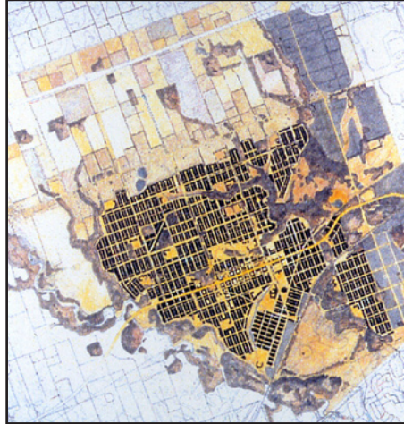
SEATON NEW TOWN

Our projects range in size and complexity from single lot site plans to new communities, from high density urban to semi-wilderness areas.