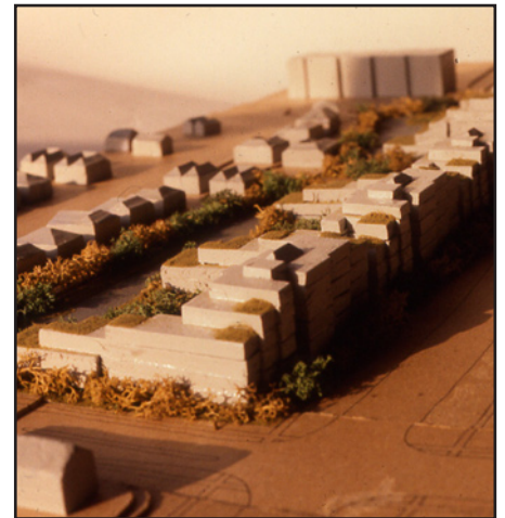
MISSISSAUGA URBAN INFILL